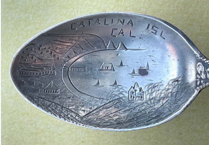
on Watson #337 - nautical themes